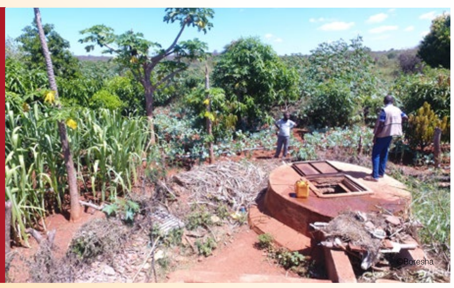
COVACA and DRR planning exercise in Rhamu

The DRR action plans were also shared with other actors with community led advocacy done for integration of the plans into County Government's CIDP 2018 – 2022 (County Integrated Development Plan 2018 – 2022).