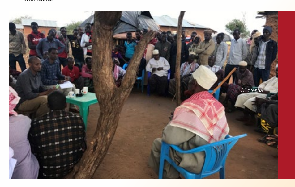
June 2018, Meeting with Kukub community members

This was done at different tiers i.e County level, sub-county level and community/village/location level and was aimed at securing stakeholders approval of our operation and interventions having already identified target areas following the stakeholders mapping exercise. At county level, special CSG (County Steering Group) meeting bringing together stakeholders from National and County Government ministries/departments as well as other NGOs operating in the county held to discuss the project and get the stakeholders recommendations and feedback. Similar meetings were conducted at sub-county and community level to discuss the same with sub-county/ community authorities and stakeholders. Participatory approach in the spirit of upholding transparency and accountability to our stakeholders was used.